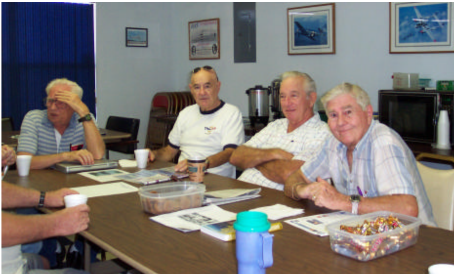
Some of the members enjoying coffee and donuts on a recent Saturday morning.