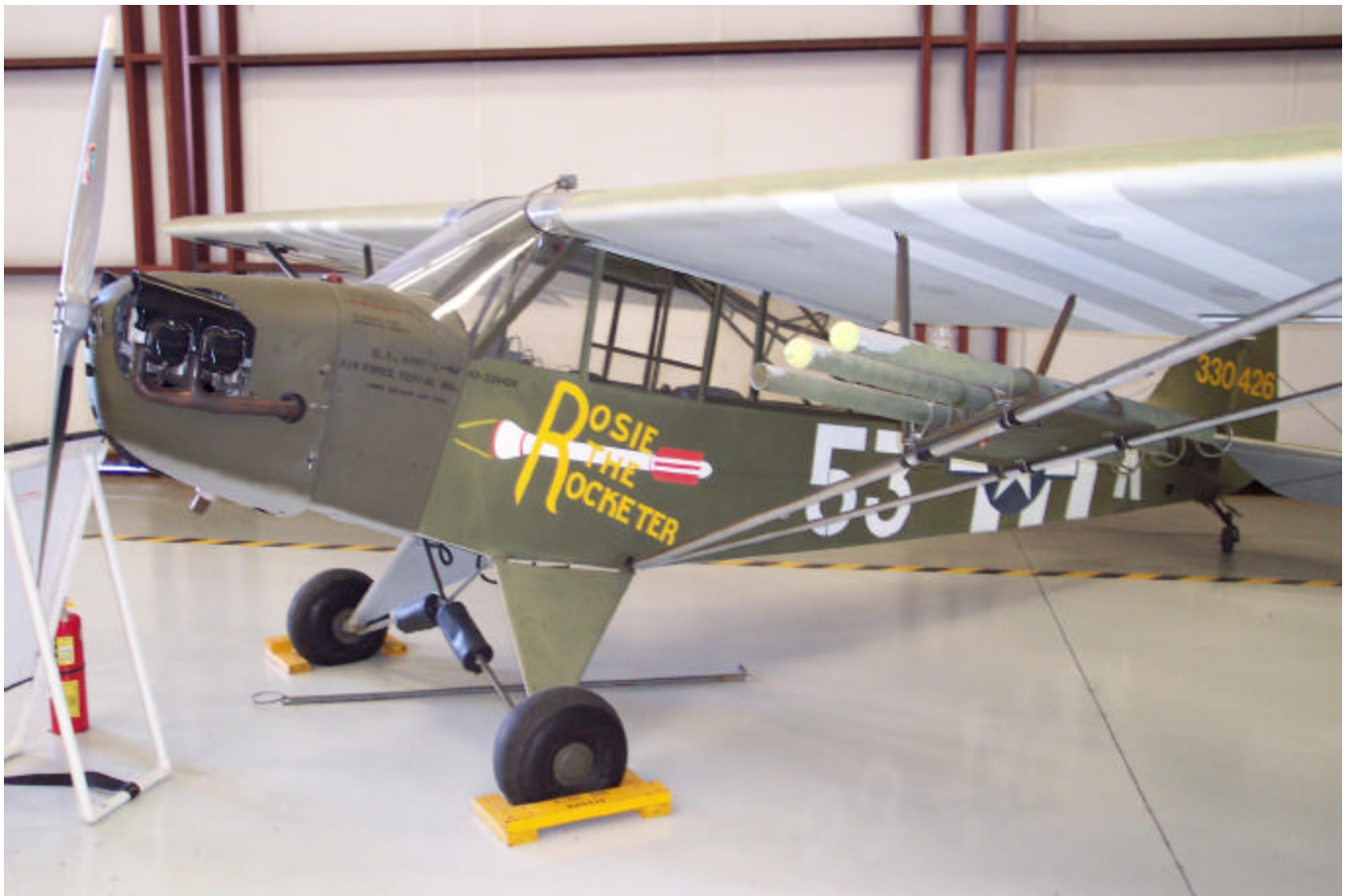
L-4J , Army version of J3 Cub

This is a flyable museum display, painted as the plane used in WWII by CPT Charles Carpenter to attack German positions and vehicles. Under each wing he attached three bazookas, and attacked the enemy with a vengeance, earning the nickname "Bazooka Charlie"