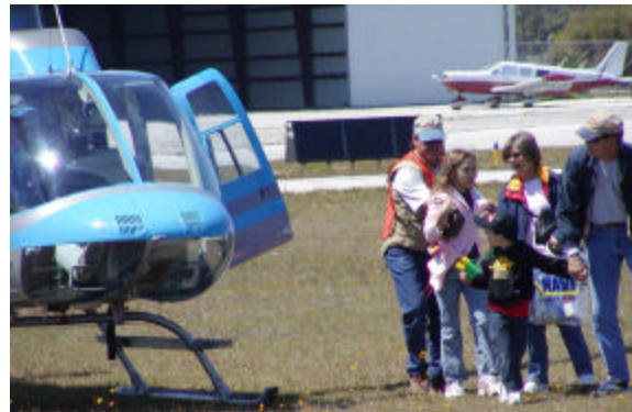
Flight line marshalling

The plans for the new hangar have been submitted to the county and to the FAA for approval. The next step is to secure financing for the construction. My goal for the project is to keep the costs below $200,000. We anticipate hangar rent at $250 a unit. If you are on the hangar list be prepared for board action to require a deposit to raise the 20% of the project cost.